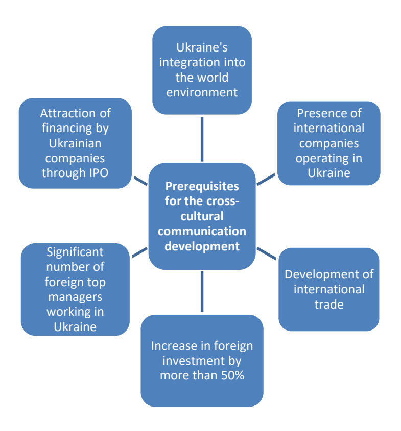
Figure 2.1. Prerequisites for the application of the concept of cross-cultural management in Ukraine